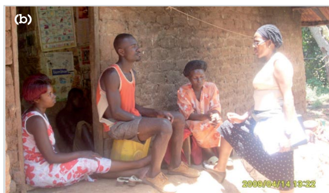
Figure 2a,b: Two examples of home visits in Uganda from a Hospice Africa Uganda palliative care worker.